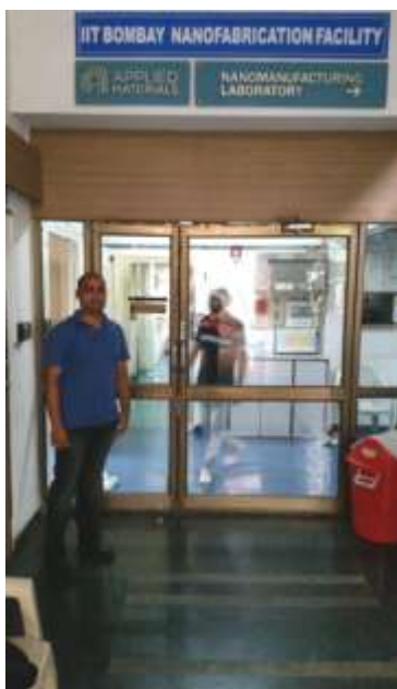
Entrance of nanofabrication Clean room lab

This workshop was focused on fabrication and characterization of GaN based Light Emitting Diode. The different vigorous training steps include; lithography by electron beam, metal deposition of electrodes, rapid thermal annealing of electrodes as well as the device and etching for passivation of inter-layers subsequently followed by photoluminescence and electroluminescence testing of the fabricated device. They also include a special session on the different aspect of the research at institute level such as the managing the funding, assistance in the initiation of research and enabling the execution of the work at IITB.