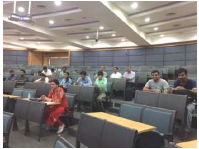
Lecture and discussion room