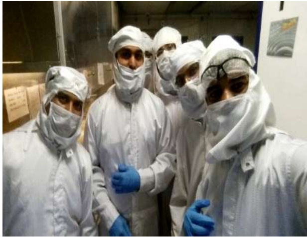
Group Members in the naofab lab