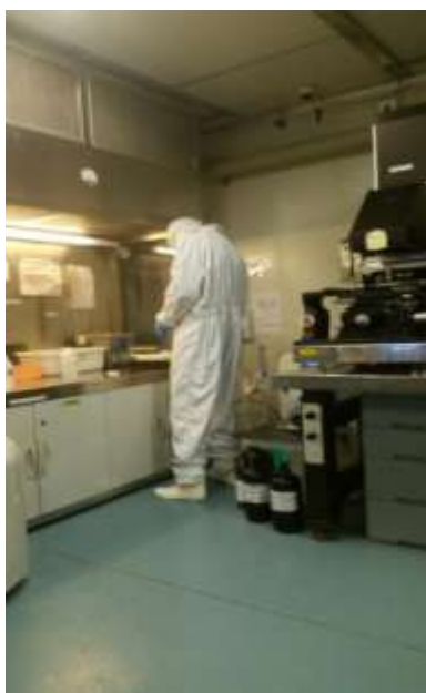
Work environment in nanofab lab (class 1000 clean room)